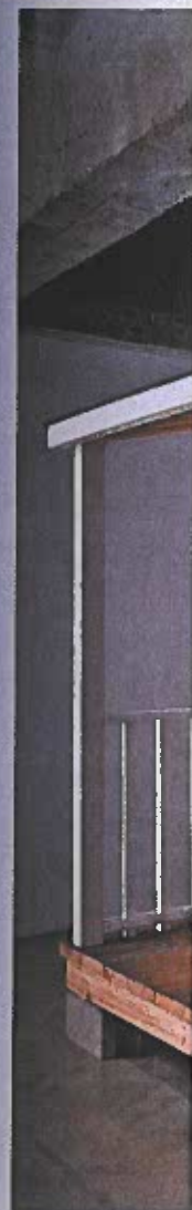
* Neukom Vivari installation, 2 Seattle Art Mus